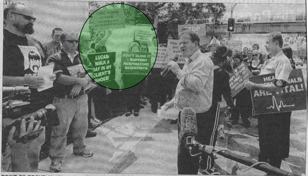
POINT TO PROVE: Health professionals protest yesterday over a dispute with the State Government over wages.

About 6000 health professionals – including radiologists and physiotherapists – are campaigning for an improved pay offer from the State Government, which has so far refused to budge from its offer.